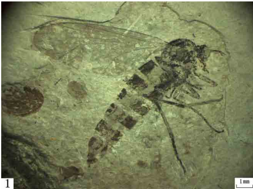
FIGURE 1. Sinorhagio daohugouensis sp. nov. (female). Body, photograph.

Distribution. The genus is known from China only and is currently represented by one species.