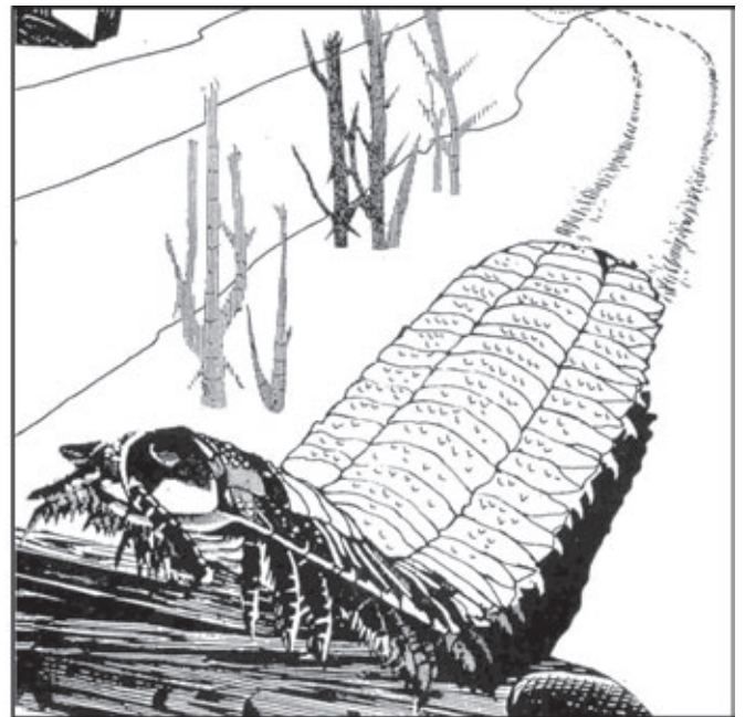
FIGURE 3. Reconstruction of Arthropleura and its trackway (from Rolfe, 1979).

The preservation of the trail as relatively deep undertracks at the surface of a fluvial channel sandstone contradicts the latest interpretation of Kraus and Brauckmann (2003) of Arthropleura as a thin-skinned caterpillar-like animal, stabilized only by means of antagonistic hydraulics of body fluids. This interpretation is obviously based on an incorrect over-interpretation of resorbed and therefore thin molting remains of Arthropleura . Instead, the exoskeleton of this giant must have been strongly sclerotized in order to make deeply impressed trackways such as those from El Cobre Canyon.