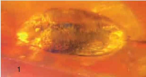
Figs 1-4: Anthrenus (Nathrenus) electron sp. n. (holotype): 1- habitus dorsal aspect; 2- ventral aspect; 3- left elytron; 4- abdominal sternites.