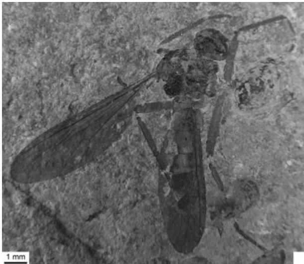
Figure 1 Photograph of Sharasargus eximius sp. nov.

Relationship. Sharasargus eximius sp. nov. is similar to S. spiniger Mostovski, 1996 in the following respects: