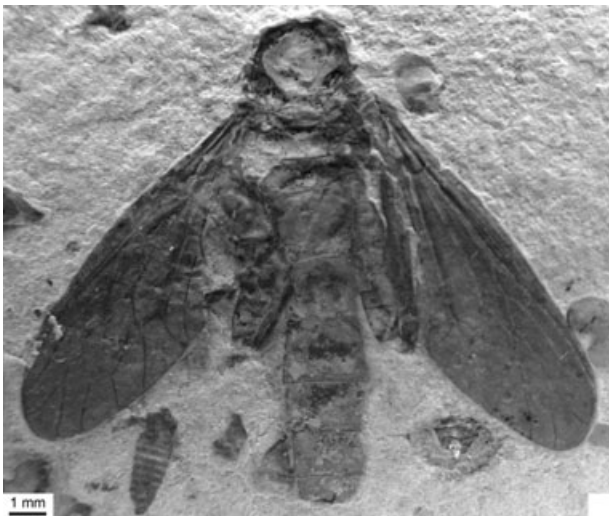
Figure 3 Photograph of Sharasargus fortis sp. nov.

Relationship. Sharasargus fortis sp. nov. is similar to S. ruptus Mostovski, 1996 in the following respects: vein Rs_1 slightly longer than vein Rs_2 ; vein R_5 long; vein