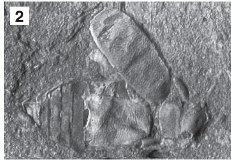
Figs 1, 2. Newly discovered insects from the Talbragar beds: (1) Protopsyllid, dorso-ventral view; (2) Beetle, dorsal view.