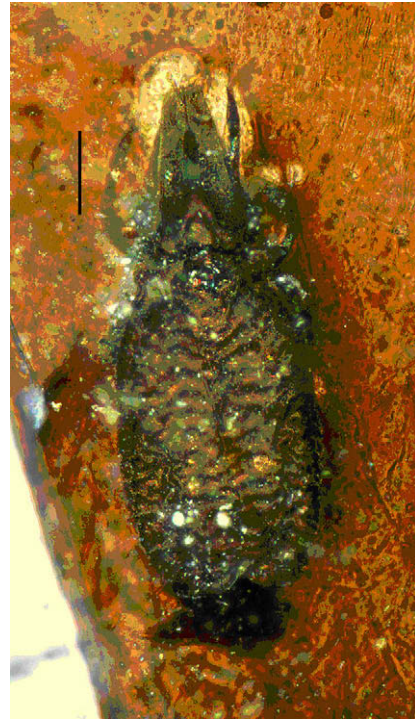
Fig. 3. Ametroproctus valeriae sp. nov. Microphotography. Holotype CPT-3341. Dorsal view. Scale bar 100 \mu m.

complete specimen present in a transparent, clear piece of amber of 3 \times 2 mm into an epoxy resin preparation of 21 \times 15 \times 1 mm.