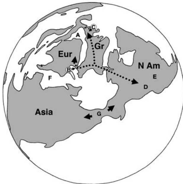
Figure 3 Early Eocene intercontinental dispersal routes between Europe and North America open to Palaeopsychops : across the northern Atlantic route (most likely, dotted line) or across Asia via Beringia (but note Obik Sea barrier). Reconstruction of Early Eocene continental and shoreline position, redrawn from Hooker & Dashzeveg (2003), modified from Smith et al. (1994) and Bonde (1997). De Greer and Thulean land bridges may not have been open at the same time. A , Fur Formation; B , De Greer Land Bridge; C , Thulean Land Bridge; D , Okanagan Highlands; E , Florissant; F , Obik Sea; G , Bering Land Bridge; Eur , Europe; Gr , Greenland; N Am , North America.

We apologise to the authors and readers for these errors and reproduce the correct version of the figures below.