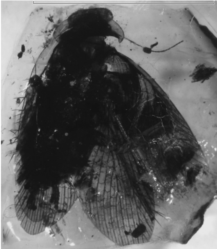
Fig. 2. Female habitus of Ocelloblattula ponomarenkoi gen. et sp. nov., Early Cretaceous Lebanese amber. Scale bar 5 mm.

reaching about one-third of elytron; anal area weakly sclerotized, with 8 simple branches of A running parallel to CuP and reaching anal margin of elytron.